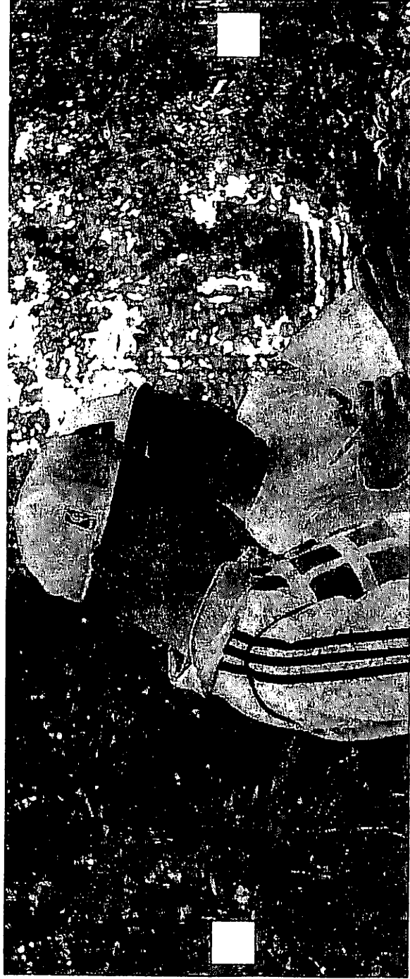
JCU Rainforest Research Station Data Collection

AUSTRALIAN SCHOOLS INTERNATIONAL GROUPS PROGRAMS ABOUT BOOKING CONTACT