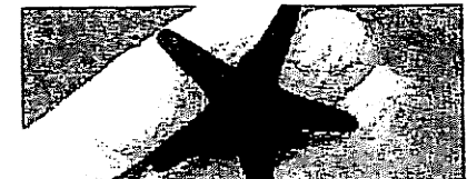
Reef and Marine Science